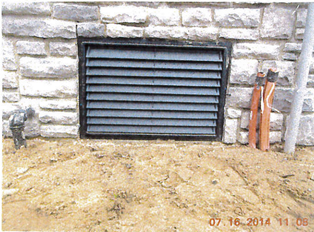
VENT - TYPICAL OF 2